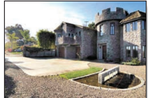
Private "Castle" Ocean View West Solana Beach

624 Canyon 4 BR + Bonus Rm 4BA 3882 Sq Ft* $1,699,000