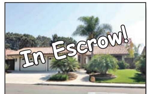
Spacious 1-Level. Golf View. Lomas Santa Fe

440 Santa Helena 5 BR 3 BA 2678 Sq Ft* .23 acre $1,099,000