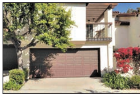
Gorgeous Remodel & Setting Santa Helena Park Court

951 Santa Helena Park Court 2 BR + Loft 2.5 BA 1737 Sq Ft* $627,000