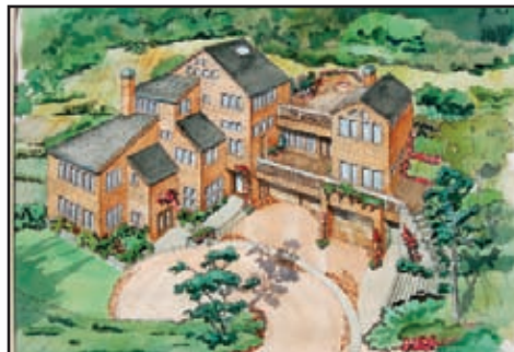
Lagoon View Home Being Built Rural Del Mar

2136 San Dieguito Road 4 BR 3 BA 1.52 acres $2,479,000