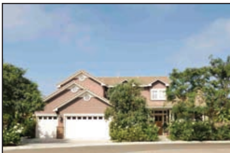
Grand Home in Cul de Sac Cardiff Composer District

1510 Vivaldi 5 BR 4.5 BA 3840 Sq Ft* .42 ac $1,499,000