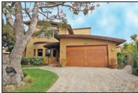
Architectural Masterpiece West Solana Beach

514 Seabright Lane 3 BR 3.5 BA 3452 Sq Ft* .24 acre $2,575,000