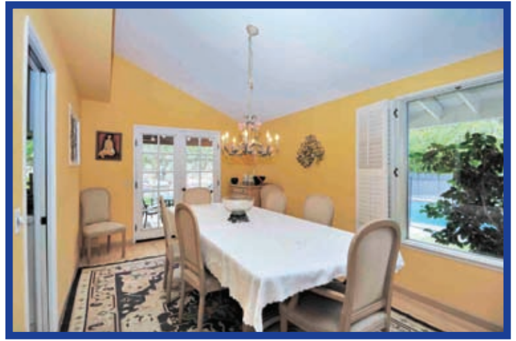
Dining room off kitchen & living room