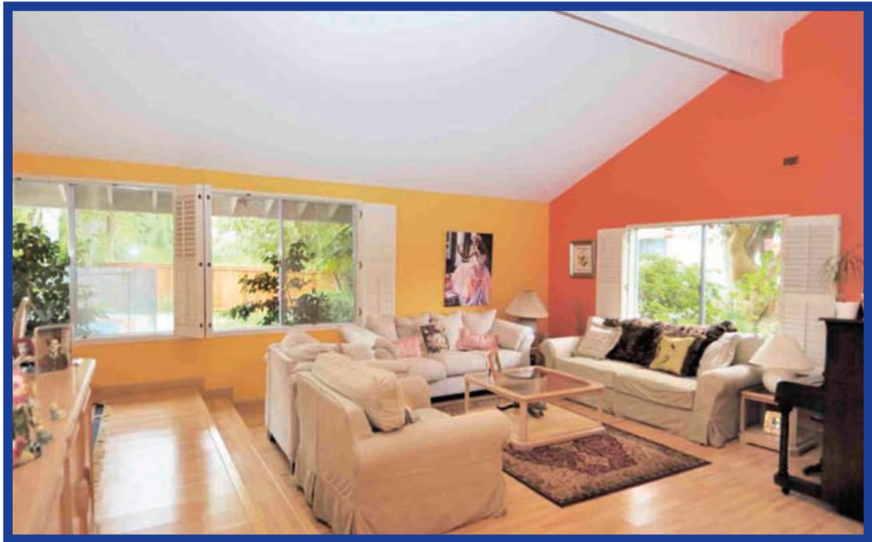
Large living room with beautiful floors & lots of light