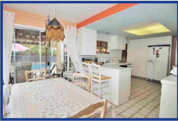
Informal eating area off kitchen