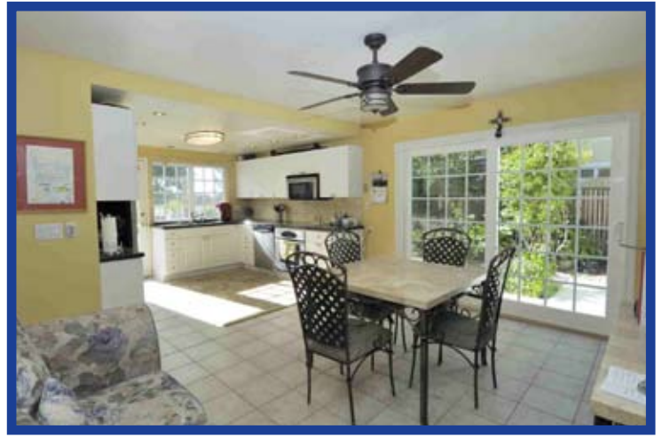
Informal eating area opens to side yard