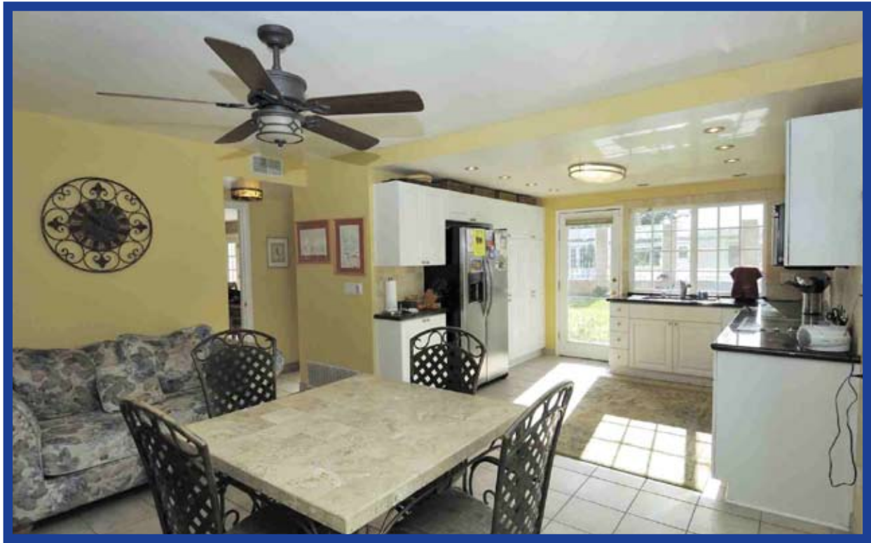
Large kitchen area with informal eating area & loads of light