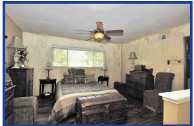
Another view of master bedroom