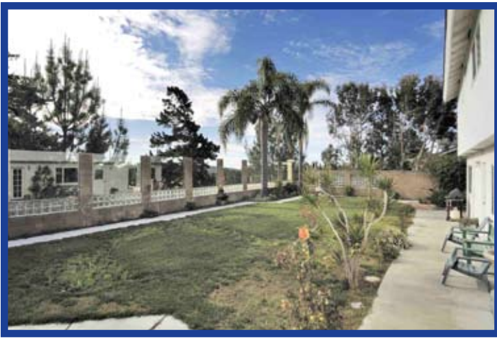
Another view of the large backyard