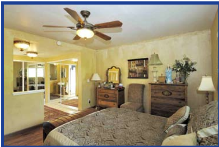
Master bedroom opens to bath area