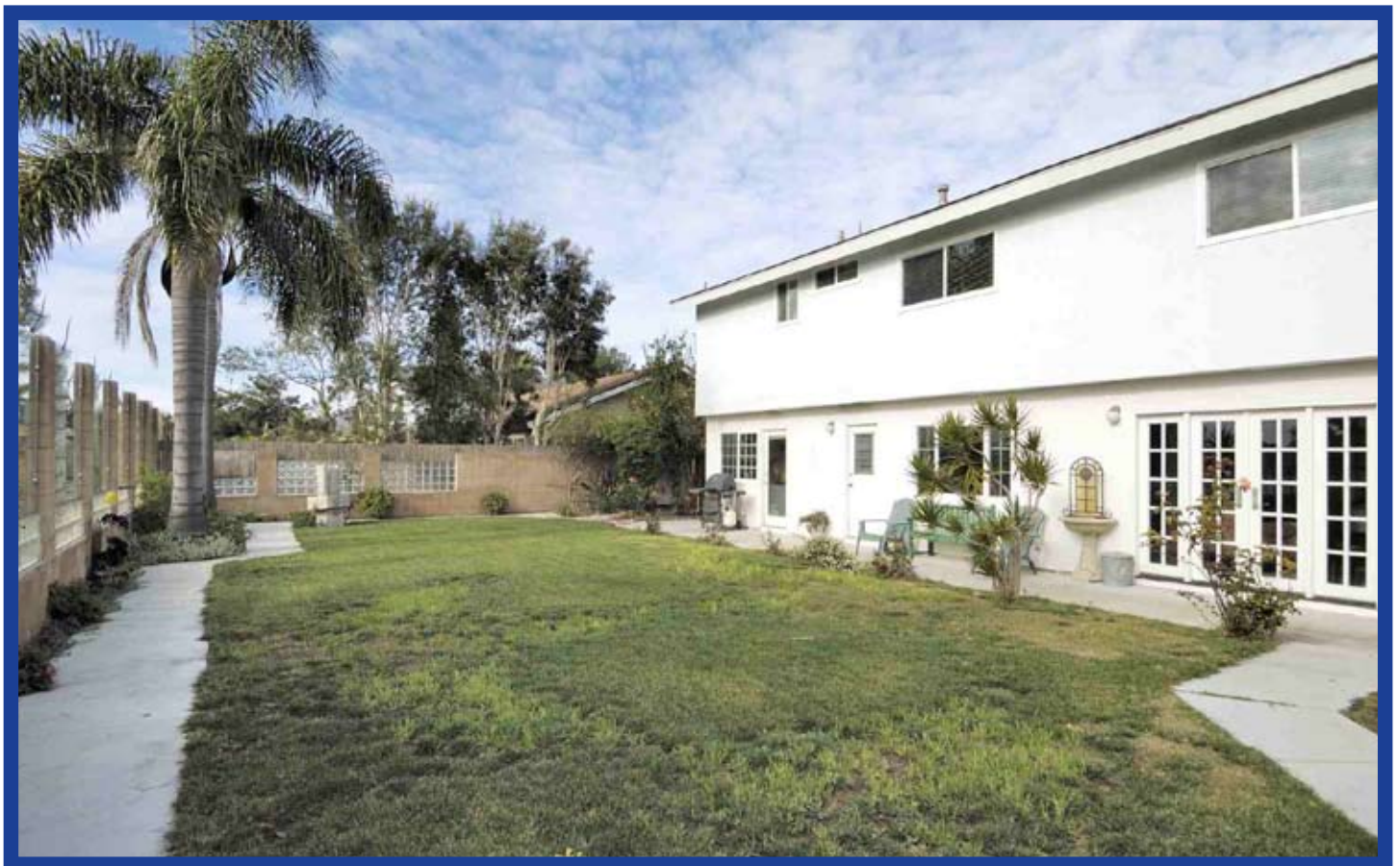
Spacious, private backyard with lots of room to play & entertain